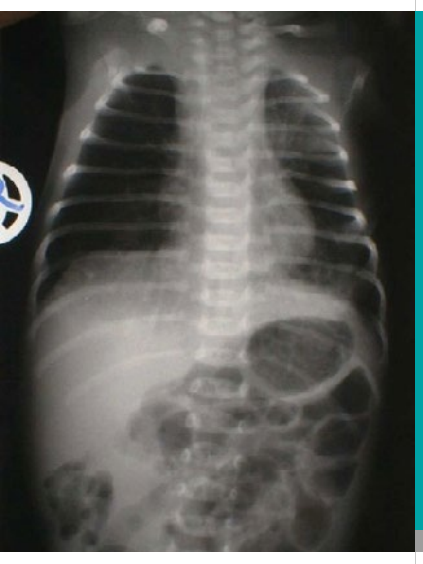
CXR on admission: nasal CPAP (PEEP 5 cmH<sub>2</sub>O, FiO<sub>2</sub> 0.3) with mediastinal shift.